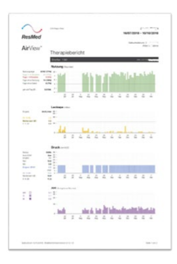
Remote monitoring device

For the management of patients with COPD, telemonitoring has been shown to have a positive impact on the patient, offering a more rapid clinical response to ensure that those at higher risk of exacerbation receive the care they need.<sup>52</sup> Moreover, telemonitoring can improve the quality of care through enhanced access to patient data, disease management and patient engagement.<sup>53</sup> Patients may also experience improved satisfaction by avoiding burdensome inperson clinic visits and/or decreased anxiety while being monitored.<sup>54</sup>